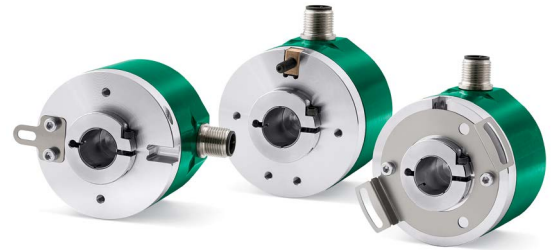
CK60 • CK58 • CK59